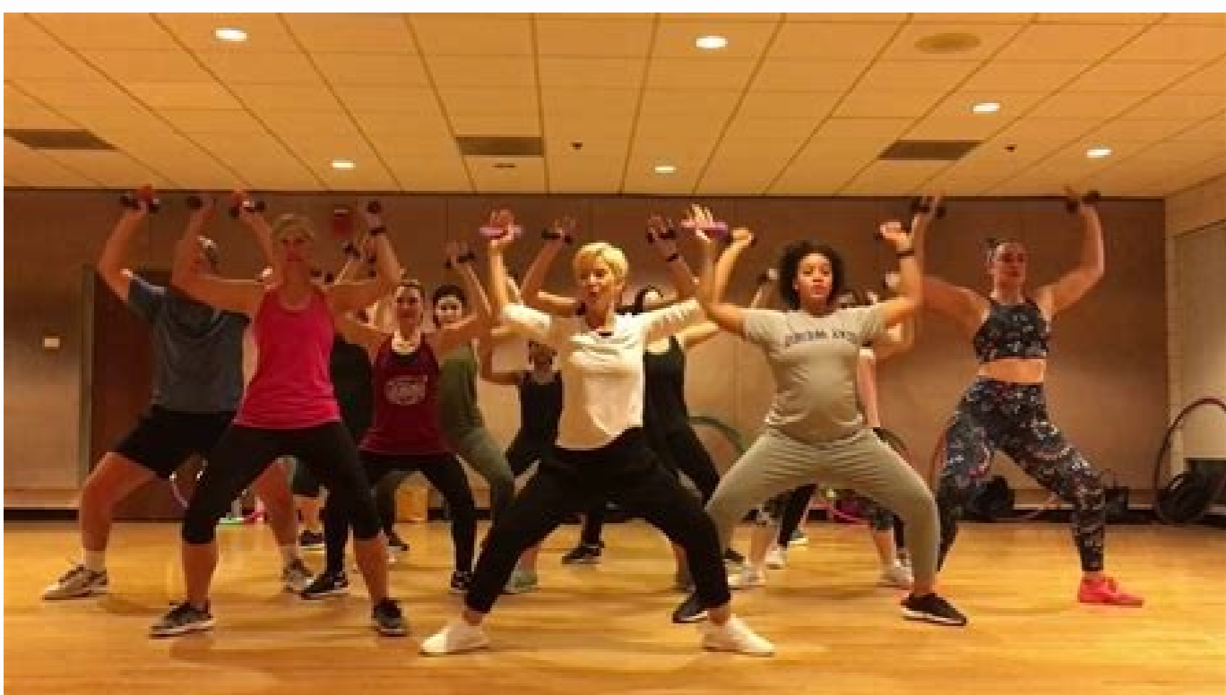
Bodybuilder gym workout videos. World best bodybuilder workout videos. Bodybuilder workout videos download. Pro bodybuilder workout videos. Best bodybuilder workout videos.